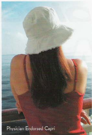
Physician Endorsed Capri