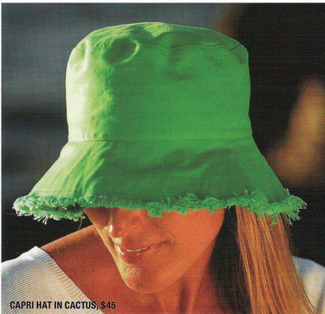
CAPRI HAT IN CACTUS, $45